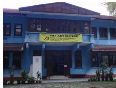
View of MIA Art Centre

Subject, form, content, visual analysis, style research