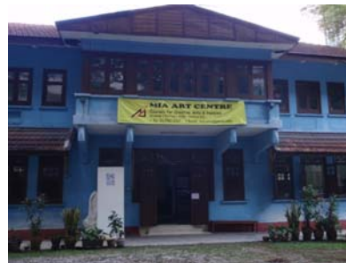
View of MIA Art Centre

There will be 8 sessions of 2-hour session each in this level.