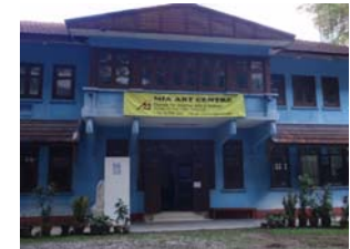
View of MIA Art Centre