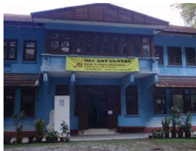
View of MIA Art Centre